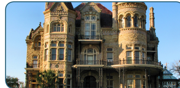
Bishops Palace Galveston